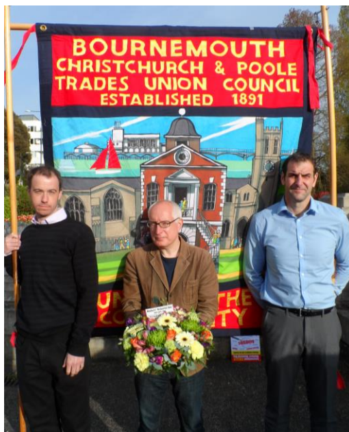
Trades Council members mark WMD in 2015

Workers' Memorial Day – On 28 April 2015, the trades council laid a wreath at the war memorial in Bournemouth Gardens to commemorate all those who had died at work, under the banner: “Remember the dead, fight for the living”.