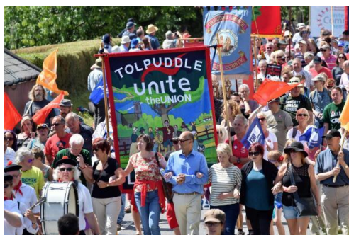
One of the many banners at the 2015 Tolpuddle Festival

Tolpuddle Martyrs' Festival – As ever, the trades council had a presence at this year's event in July, with different members active on stalls, in workshops and stewarding the site.