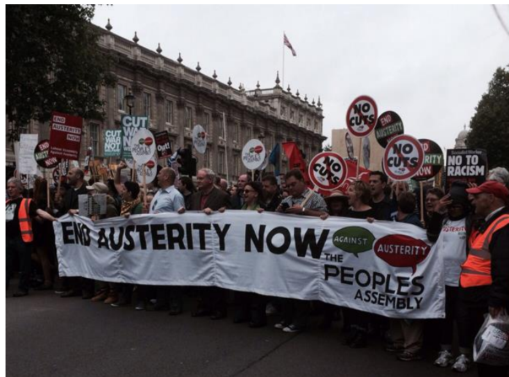
The head of the People's Assembly demo on 20 June 2015

Dorset People's Assembly – On 20 June, members of the trades council attended the national People's Assembly event in London. Throughout the year, the trades council has also supported the local Dorset People's Assembly and its activities. This important work will continue throughout 2016.